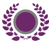
Government and Municipalities